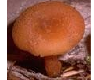
e) Laccaria laccata