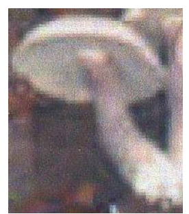
g) Suillus sp.