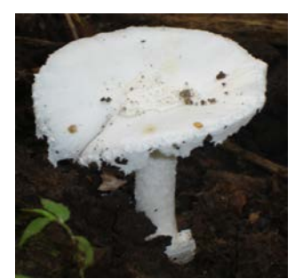
i) Amanita sp.