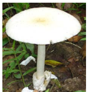
h) Amanita sp.