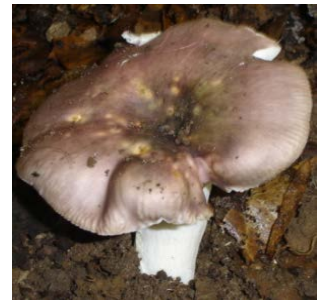
d) Lactarius sp.