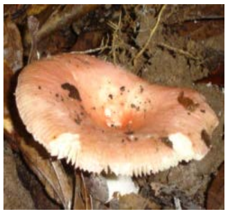
a) Russula sp.