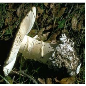
c) Russula sp.